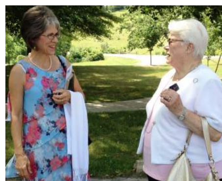
Fellowship following the worship service on July 16th.