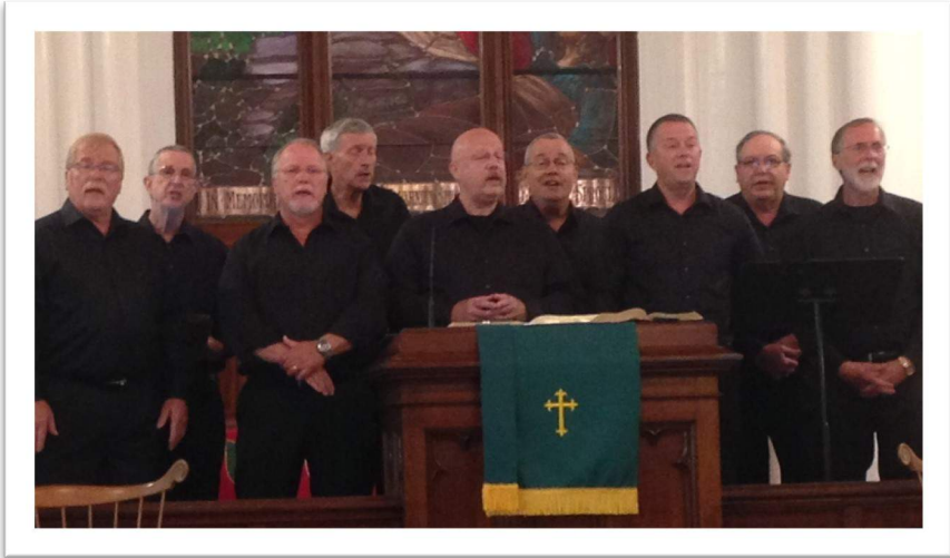
“The Faithful Men” performing at the Vespers Service on July 18th