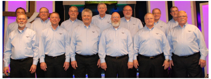
The Faithful Men

The last Vespers Service of the summer will be on Wednesday, August 21st, at 7:00 pm. The Faithful Men will be performing and the theme will be “Meditations on Hope and Eternal Life”. We hope you will join us for what will be a wonderful performance and time of worship by this extremely talented group!