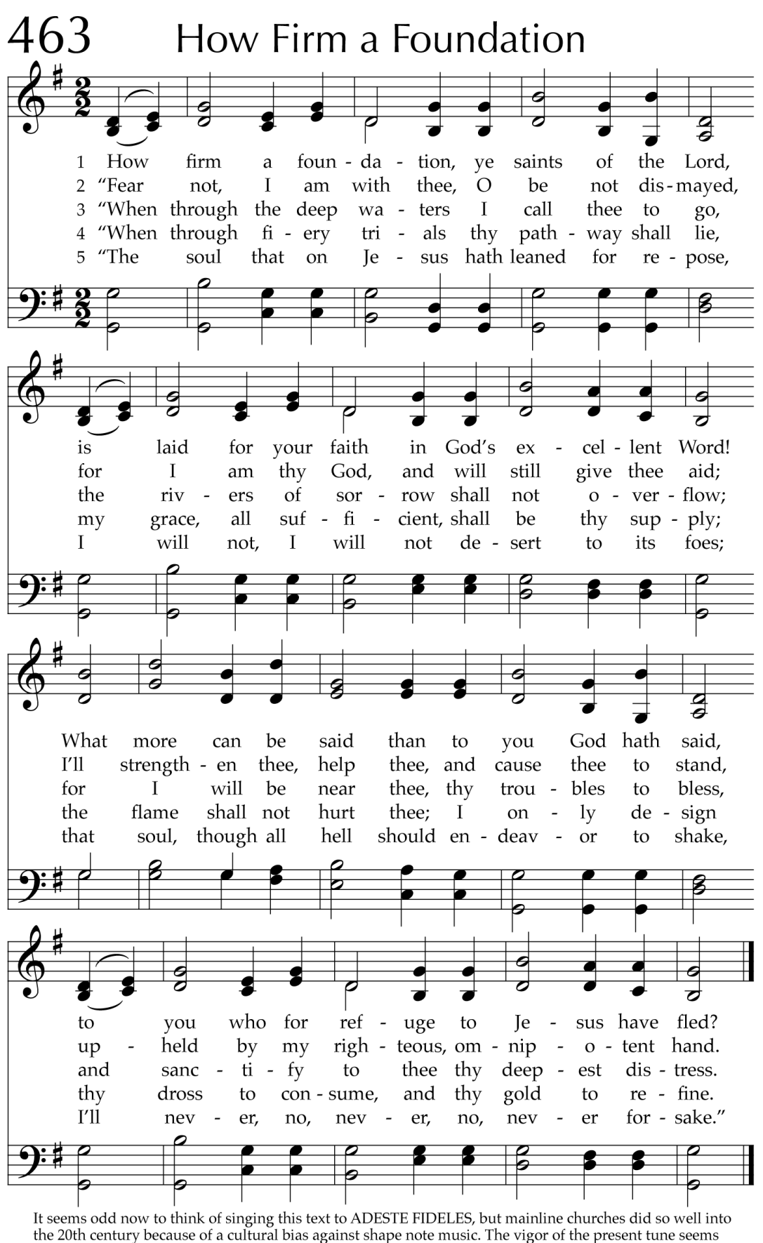
especially right for the final line's reference to Hebrews 13:5.