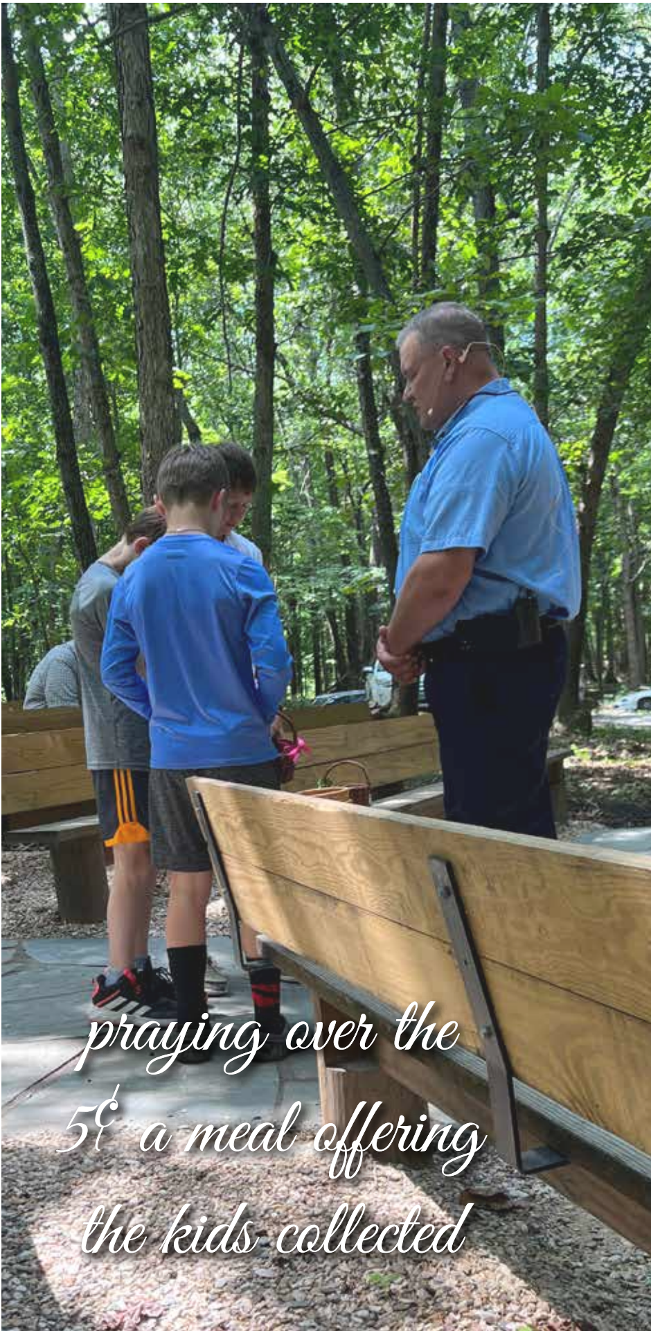
praying over the 5¢ a meal offering the kids collected