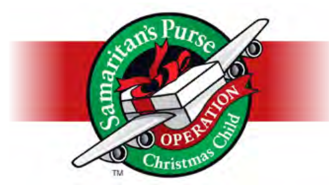
Shoeboxes are now available in the vestibule. They are due November 12th

If you would like to donate candy, please leave in the kitchen — If you can set up your car for trunk or treat, please be set up by 5:30, decorated optional — If you can help gut pumpkins, please be here at 3pm, bring buckets if you want to take the insides to your animals — If you'd like to donate snacks, please have them here by 5:00 — If you'd like to help, come on out!! Feel free to dress up!