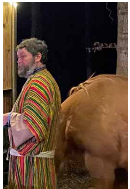
LIVING NATIVITY AT THE CHAPEL IN THE WOODS